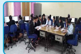
Secretarial Practice Lab