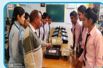
Electronic Mechanic Lab