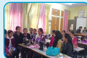
Dress Making / F.D.T Lab

Phone No.: 0532-2971803, Email: nstiwallahabad@gmail.com Website: nstiwallahabad.dgt.gov.in