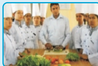
Food Production (General) Lab