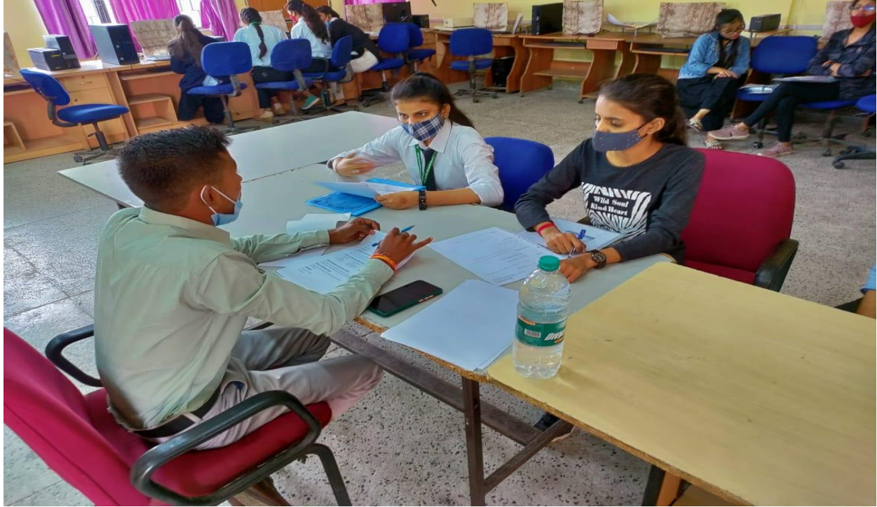
Candidates attended their face to face interview.