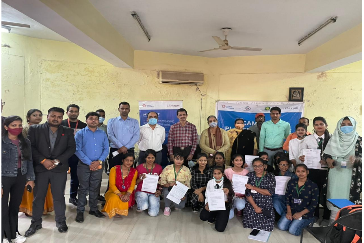
Quest Team, Employers, Teachers and Students of NSTI Allahabad in one frame.