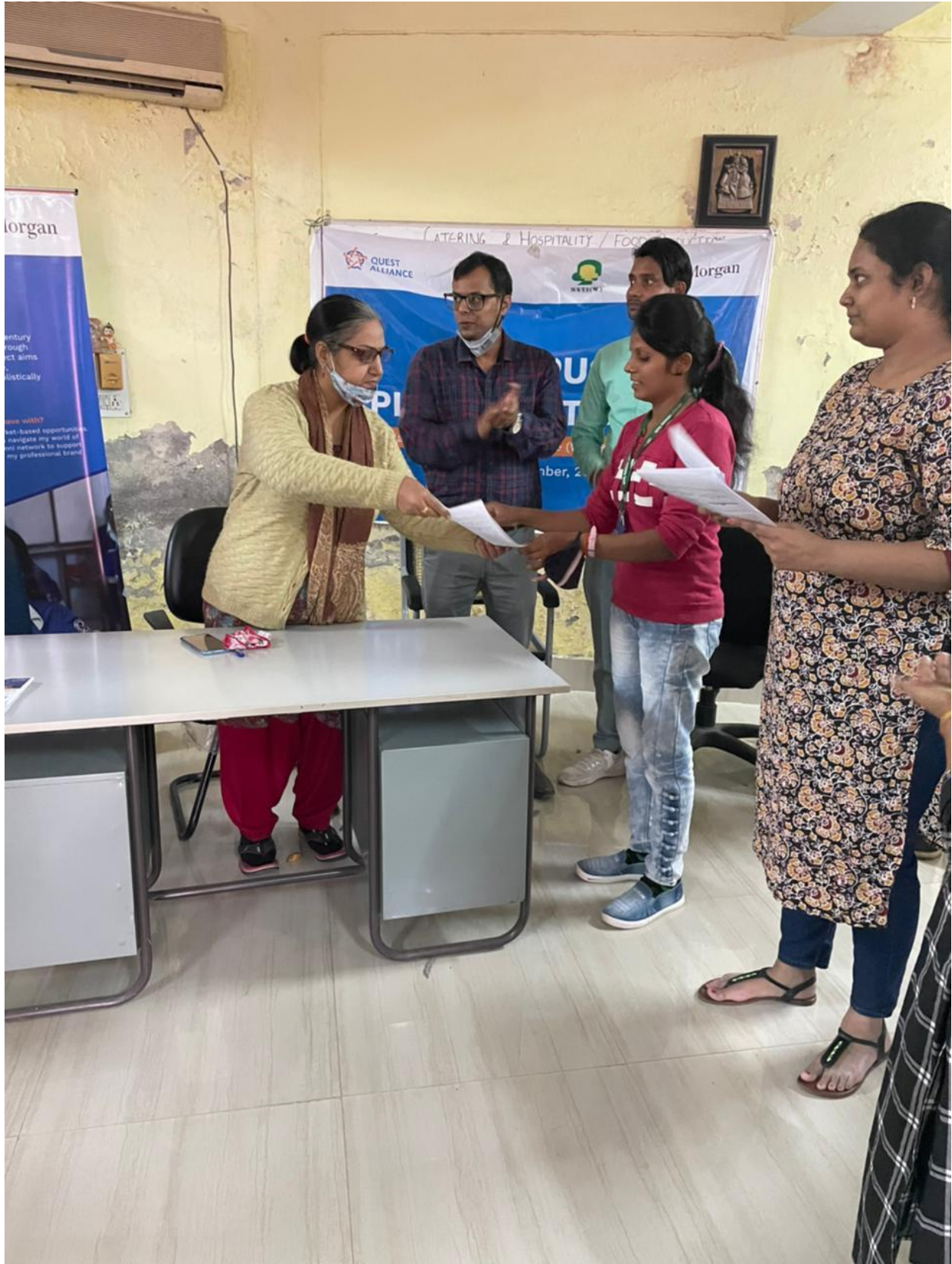
Selected candidates collected their offer letter through their principal.