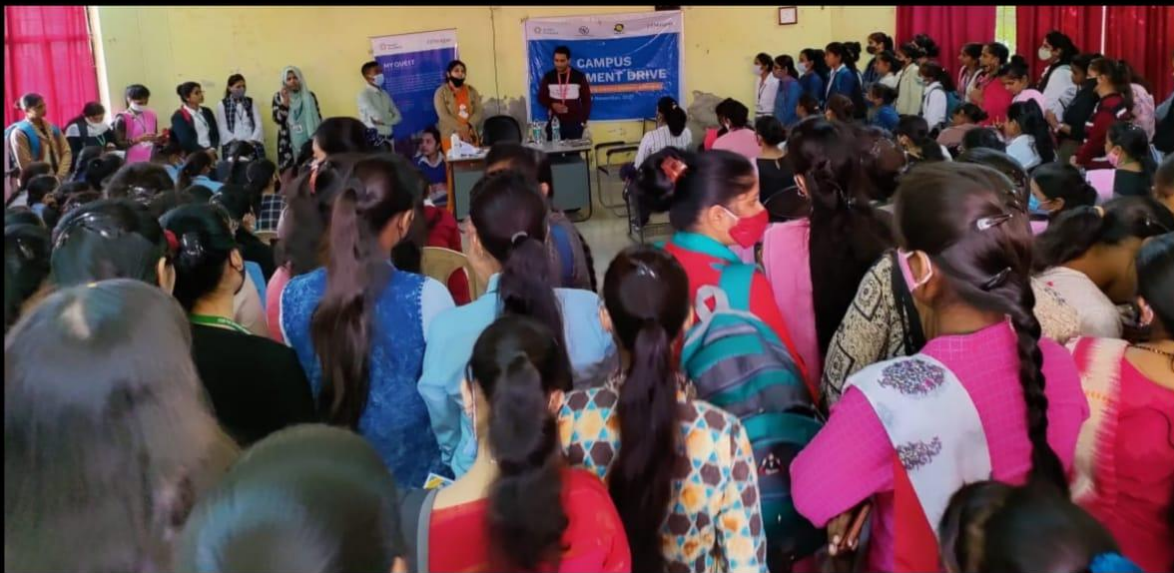
Overall Pictures of NSTI Allahabad.