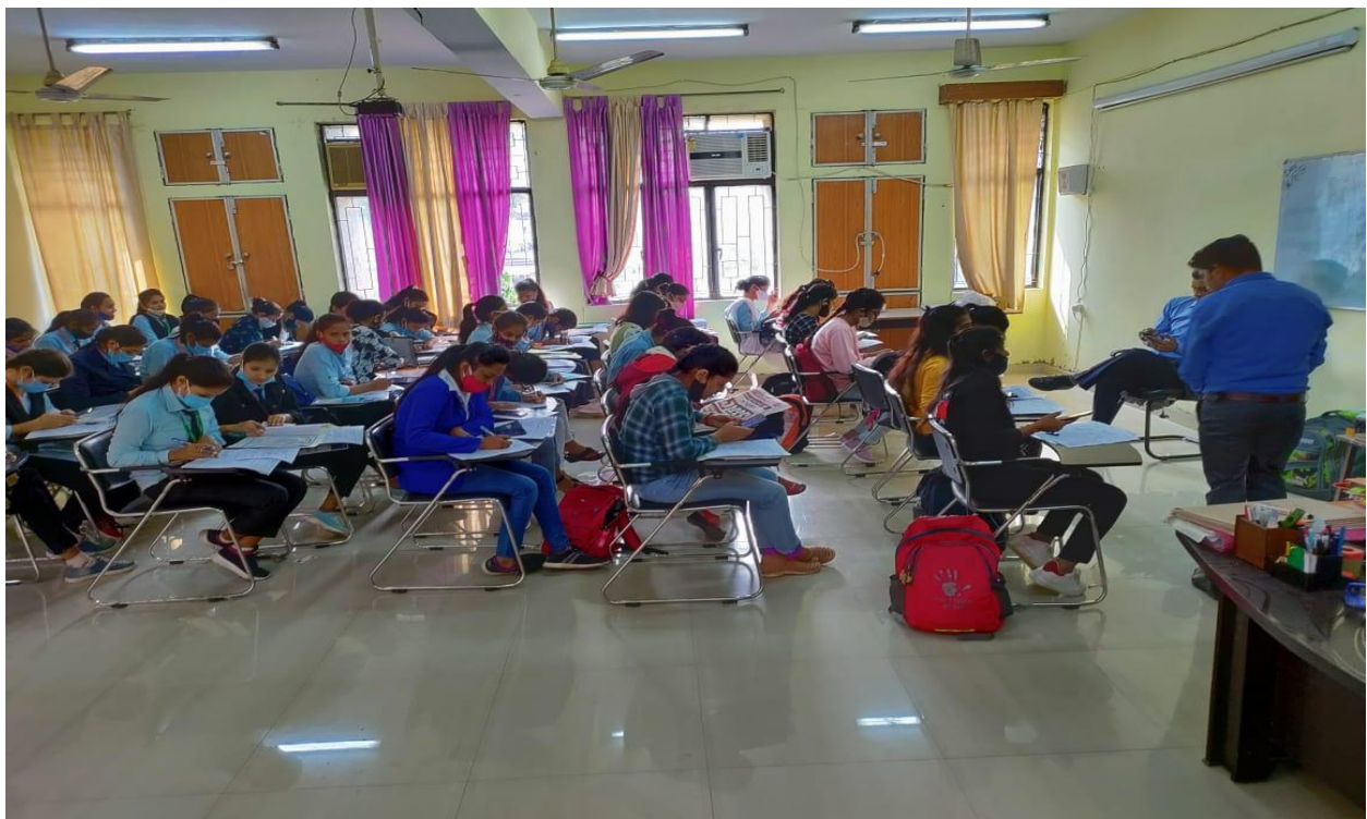
Students attend their written examinations.