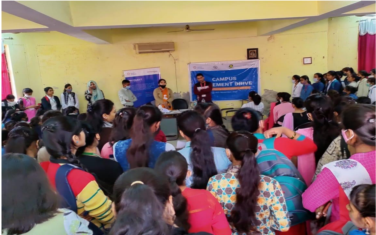
Students listen to their employers carefully.